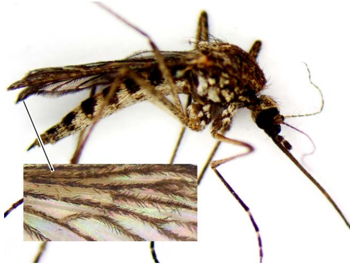
Female Aedes washinoi . Wing scales are shown to differentiate from Aedes squamiger , which has rounded wing scales.