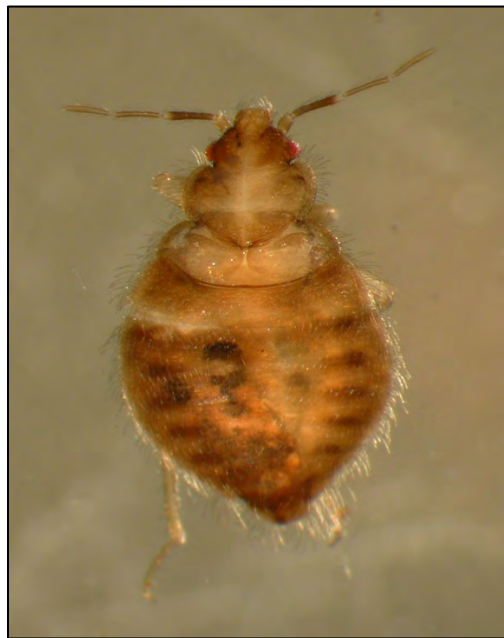
Swallow bug, Oeciacus vicarius

Swallow bugs are the hairy cousin of the bed bug, Cimex lectularius . Swallow bugs infest mud nests built by cliff swallows on the outside of buildings. Occasionally these bugs will make their way indoors and bite and feed on the blood of the occupants. However, humans are a poor host and swallow bugs need their avian hosts for their continued survival. Cliff swallows are a protected species and their nests can't be disturbed during nesting season (from about Feb. 15 – Sep. 1) without a permit from the U.S. Fish and Wildlife Service. The swallow bug pictured above was collected by a local pest control operator from a local residence.